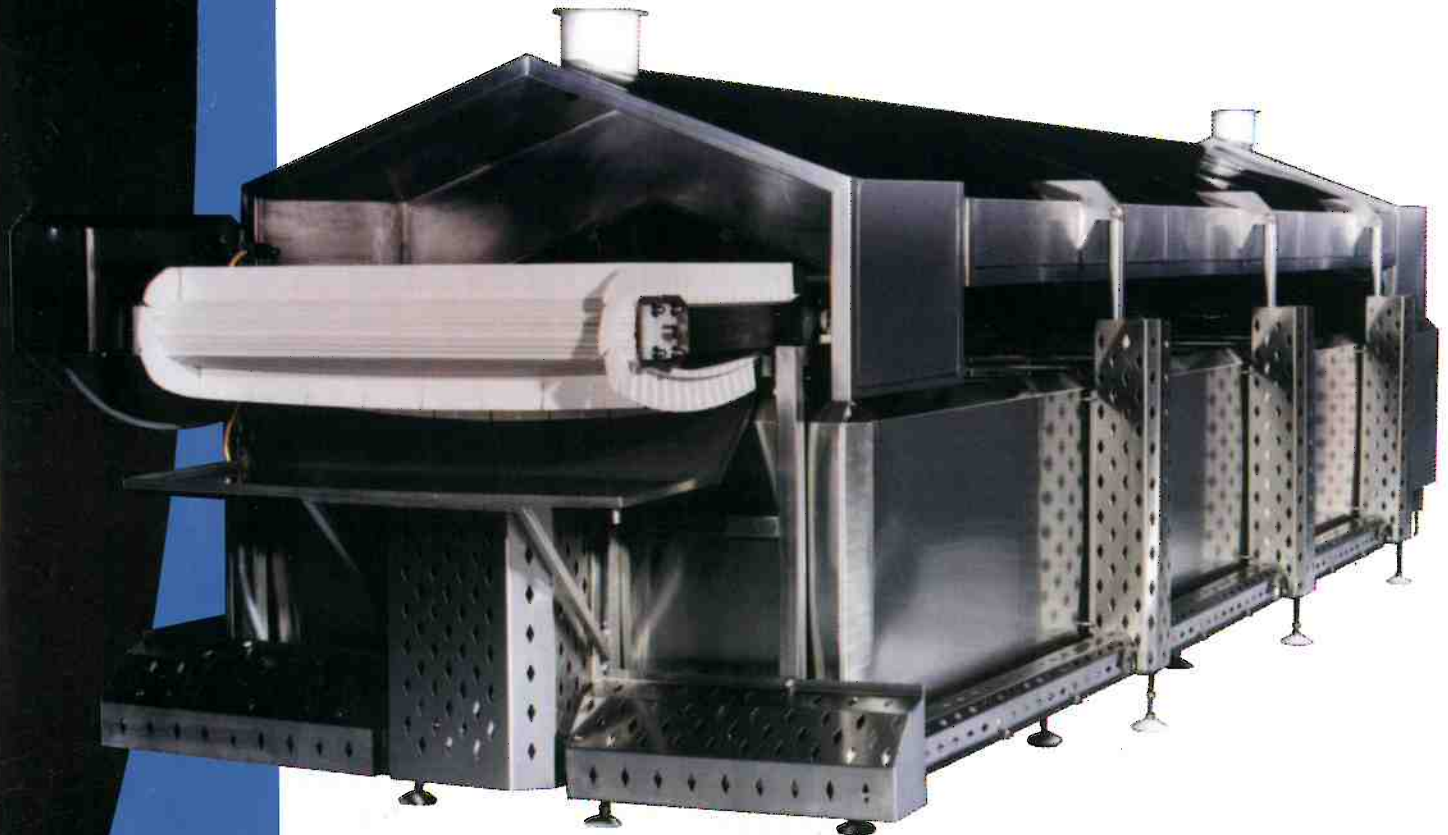
Aqua Flow II